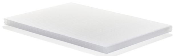
LEXAN™ THERMOCLEAR™ polycarbonate sheet